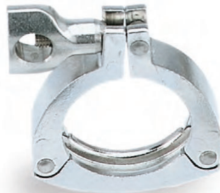
Tri-Clamp - The industry standard.

A connection is made up of a plain ferrules, a threaded ferrule, a nut and a gasket. The faces on Bevel Seat fittings are angled to create a metal to metal sealing surface. A John Perry fitting consists of a flat-faced threaded ferrule, a flat-faced plain ferrule and a profiled gasket. These joints are particularly useful with swing connections and flow diverter panels. A DC fitting utilizes the Bevel Seat plain ferrule and a threaded ferrule with a grooved face to retain a gasket. The three types of threaded fittings are designed for use in the food, dairy, and beverage processing industries. Bevel Seat Joints are in compliance with 3A standards for manual cleaning. Both John Perry and DC fittings are in compliance with 3A standards for CIP.