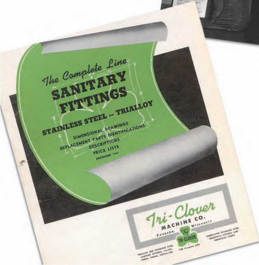
Tri-Clover fittings catalog circa 1947.